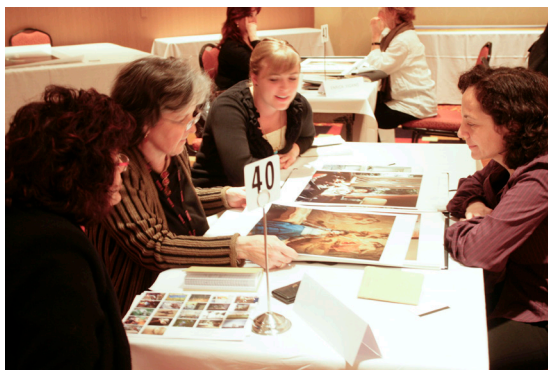
FotoFest Portfolio Review