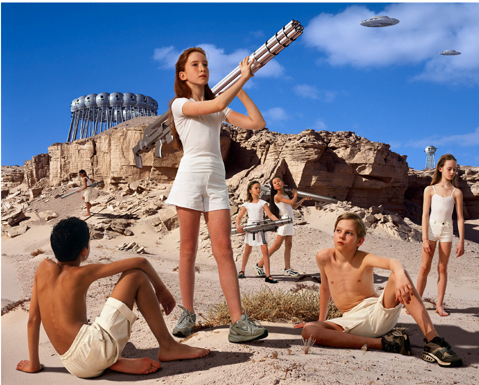
AES+F, Episode 2, No. 12, 2003 from the series Action Half Life