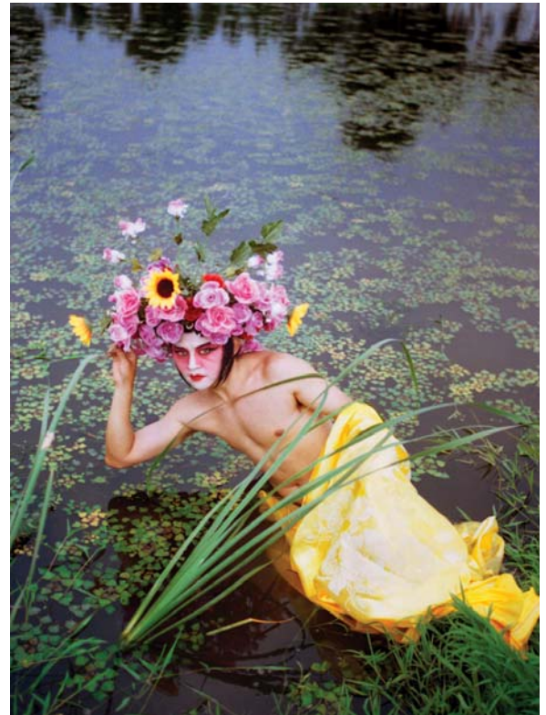
AN Hong, Water Buddha , 1997 Courtesy of the artist and Three Shadows Photography Centre, Beijing

In collaboration with FotoFest, the Museum of Fine Arts Houston (MFAH) Film Program and the UCLA's New Chinese Cinema program will present three weekends of films and videos by Chinese film-makers and video artists. March 8 - April 6, 2008. The Southwest Alternate Media Project (SWAMP) is sponsoring a call for short film submissions by Texas film-makers on Imagining China . Selected films juried with the Museum of Fine Arts (MFAH) Film Director will be presented at the MFAH April 5, 2008 and on SWAMP's television series, The Territory .