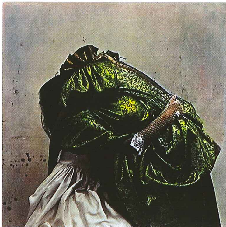
RongRong: 1997 No. 5(2), 1997, inkjet print, 43¼ inches square.

In 1934, Zhuang Xueben (1909-1984) traveled to what was officially known as "the uninhabited land" of far western China. His original destina-