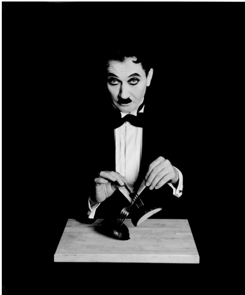
Vladislav Mamyshev-Monroe, Charlie Chaplin , from the series Heart Cancer , 2004. Courtesy of ART4.RU Museum of Contemporary Art, Moscow.

HOUSTON, TEXAS, JANUARY 23, 2012 – FotoFest announces the Russian artists and exhibitions for its 2012 Biennial Contemporary Russian Photography , which opens in Houston, Texas , on March 16, 2012 and will be on view through April 29, 2012 . The Biennial explores modern and contemporary Russian photographic history over the last five decades, from the post-Stalinist period of the 1950s to the present day. Three main exhibitions, created for the FotoFest 2012 Biennial, present three periods of Russian modern and contemporary photography, with the works of 142 artists from Russia, Belarus and the Ukraine: After Stalin , “The Thaw” , The Re-emergence of the Personal Voice (1950s-1970s) , Perestroika, Liberalization and Experimentation (1980s-2010) , and The Young Generation (2009-2012) . Of the works, on loan from private collections and the archives of the artists themselves, many are being shown for the first time outside of Russia.